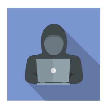
A data breach is an incident in which private, personal information is exposed, viewed without authorization, or stolen.